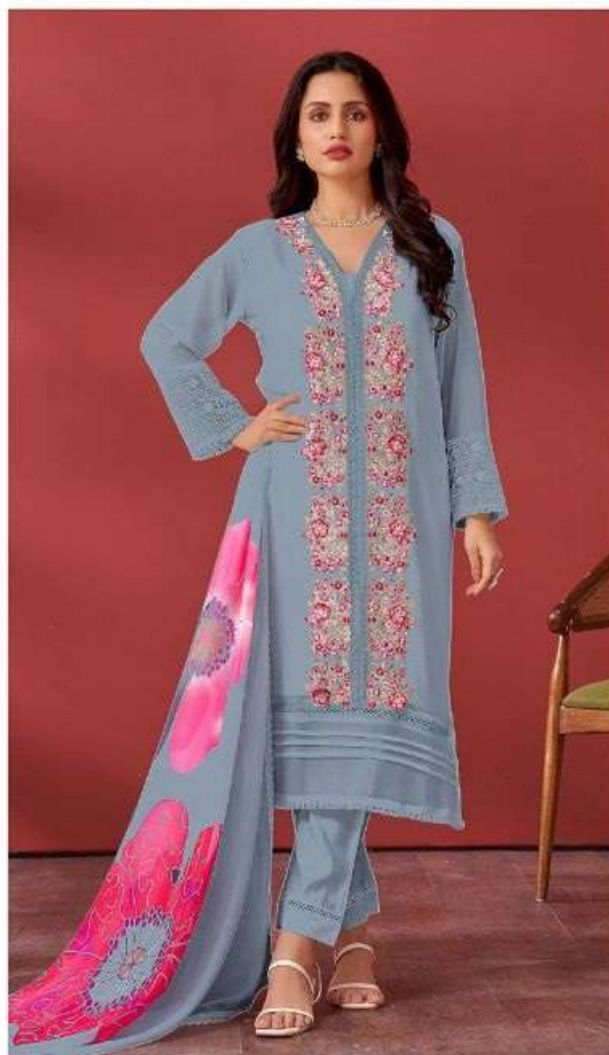
C - 1644 B