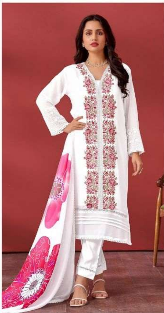
C - 1644