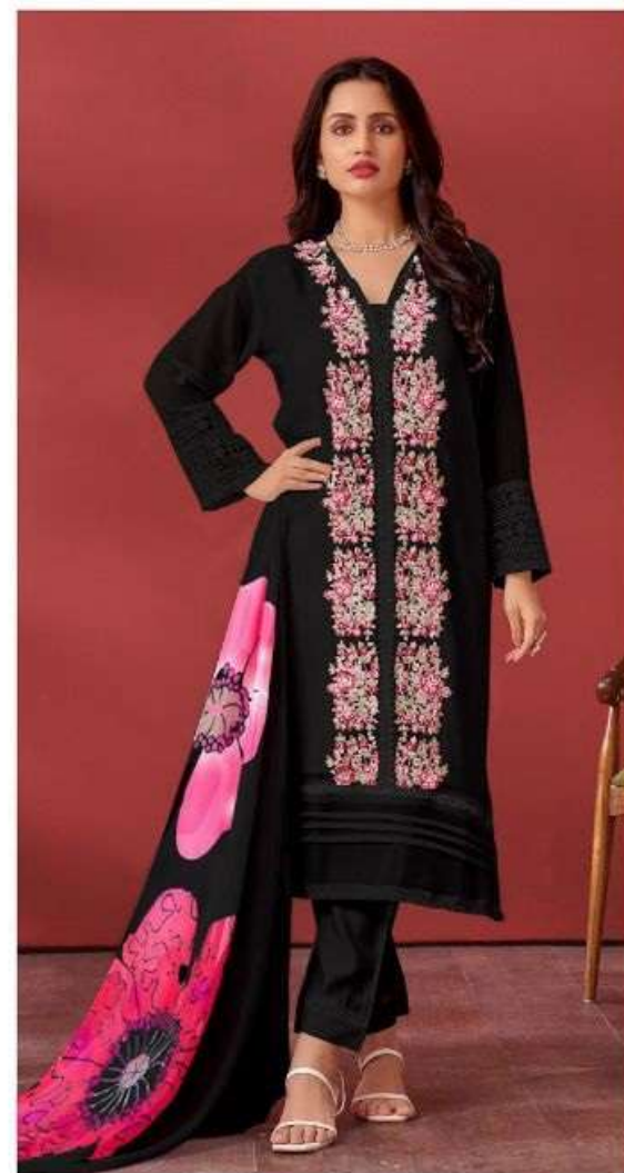
C - 1644 C