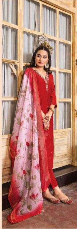
इतिवारवाट VOLUME.5 3462