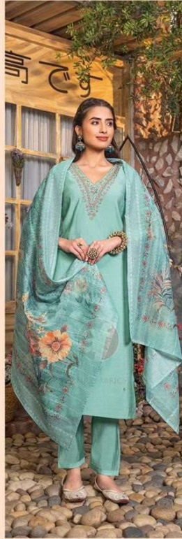
इतिवारवाट VOLUME.5 3463