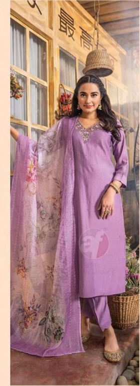
इतिवारवाट VOLUME.5 3466