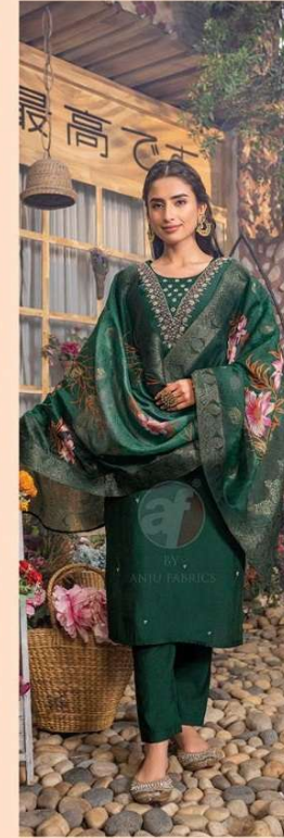
इतिवारवाट VOLUME.5 3465