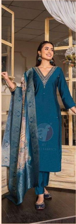
इतिवारवाट VOLUME.5 3461