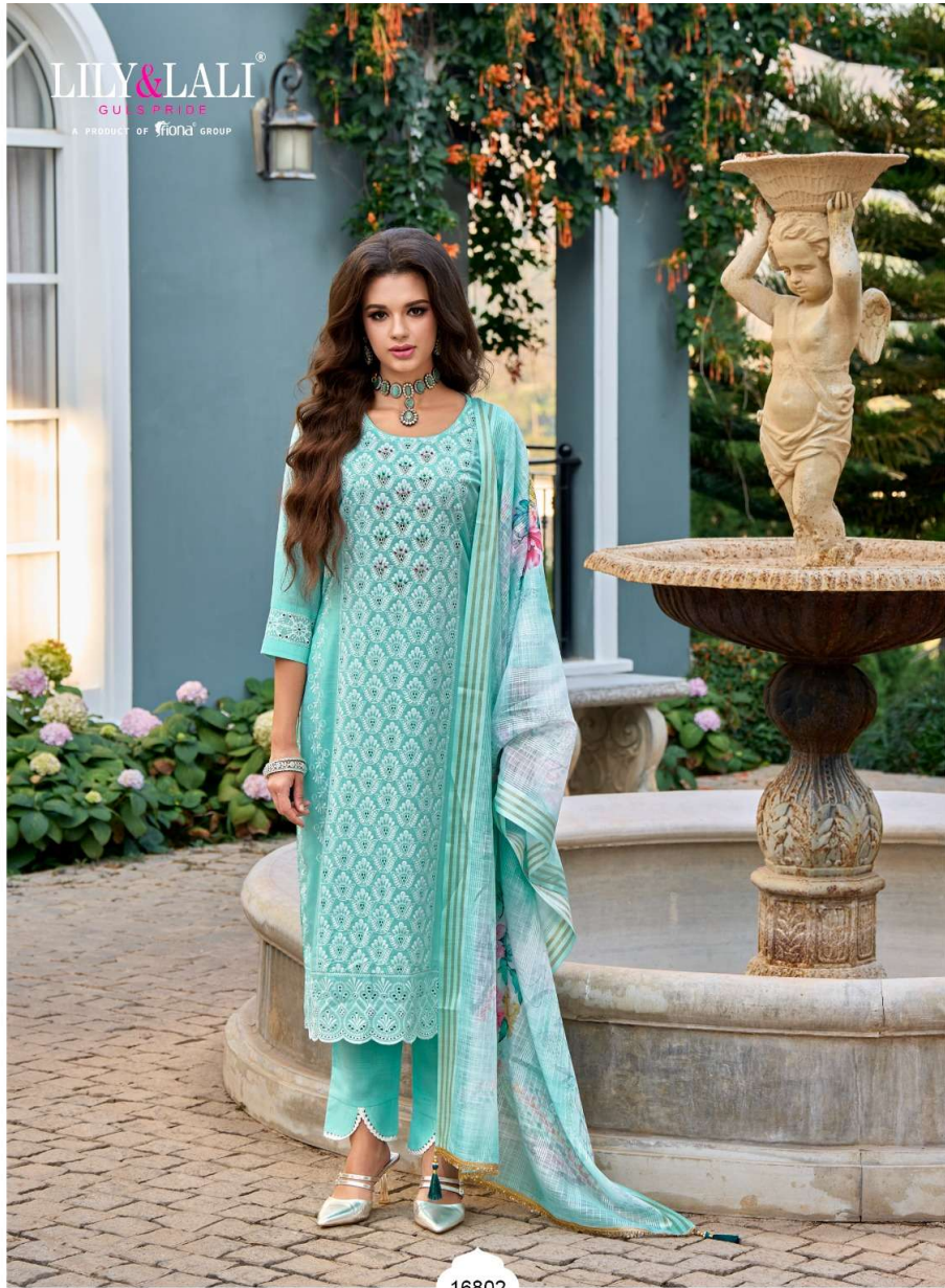
THE MODERN Enchantress