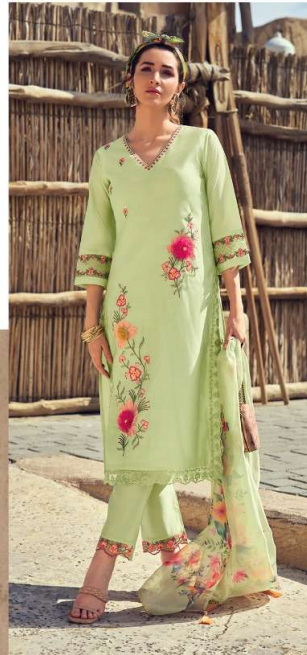
Appliqué — 16404