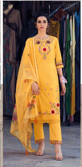
Appliqué — 16406