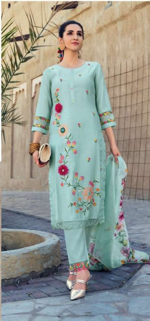
Appliqué — 16401