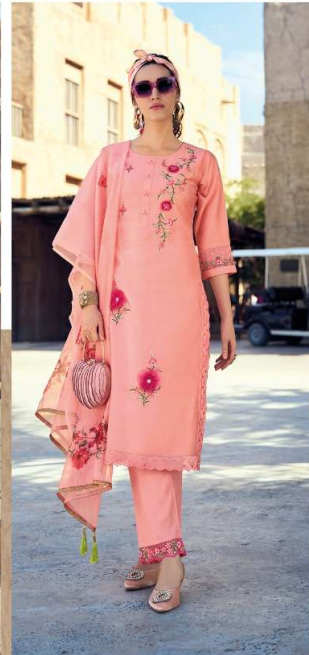
Appliqué — 16405