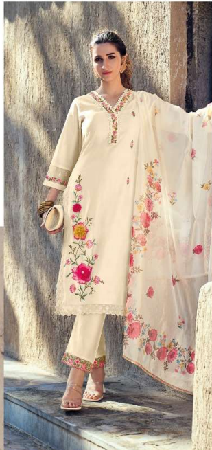
Appliqué — 16402