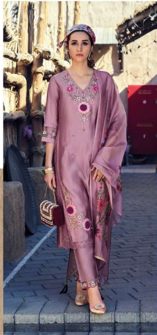
Appliqué — 16403