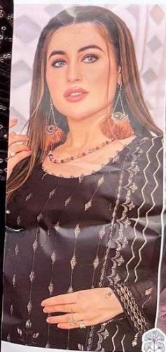
Top: Faux Georgette with Embroidery (Cut 2.5 Mtr.) ZAH BOTTOM-INNER