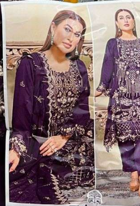
ZAHA D.N TOP: Faux Georgette with Embroidery (Curt 2.5 Mtr.) BOTTOM INNER: Chiffon (Curt 1.5 Mtr.)