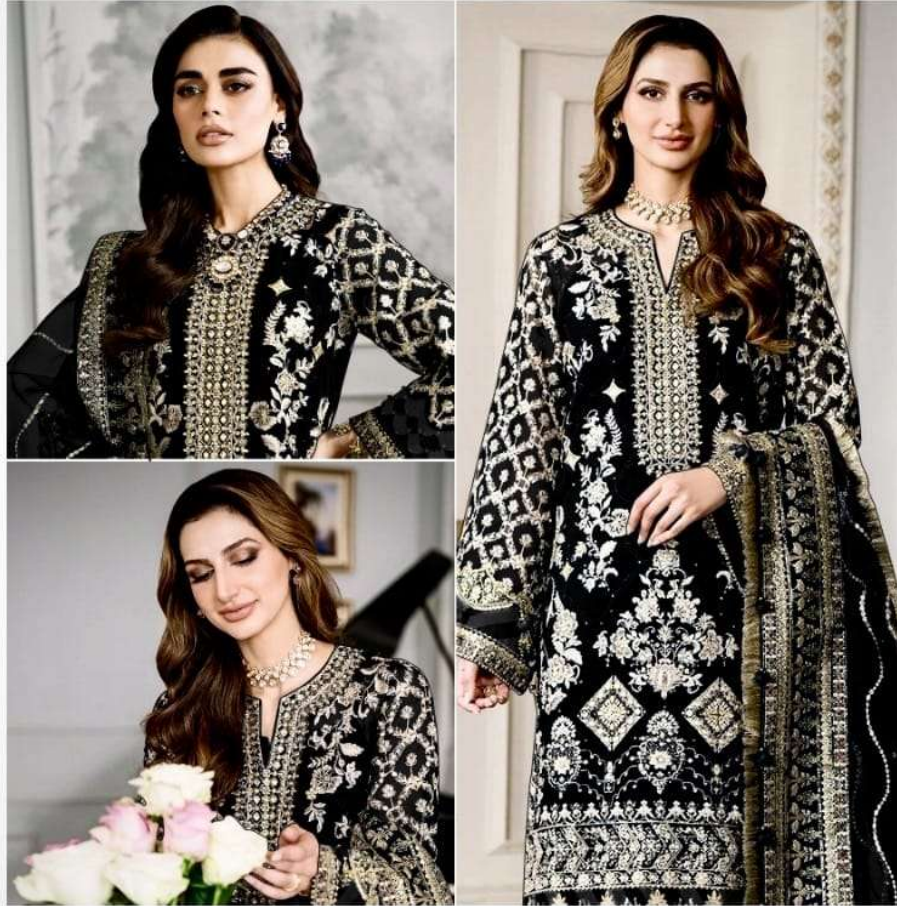
TOP- PURE FOX GEORGETTE WITH HEAVY EMBROIDERY AND SEQUENCE WORK BOTTOM/INNER- DULL SHANTOON DUPATTA- PURE ORGANZA FANCY DUPATTA AND HEAVY EMBROIDERY