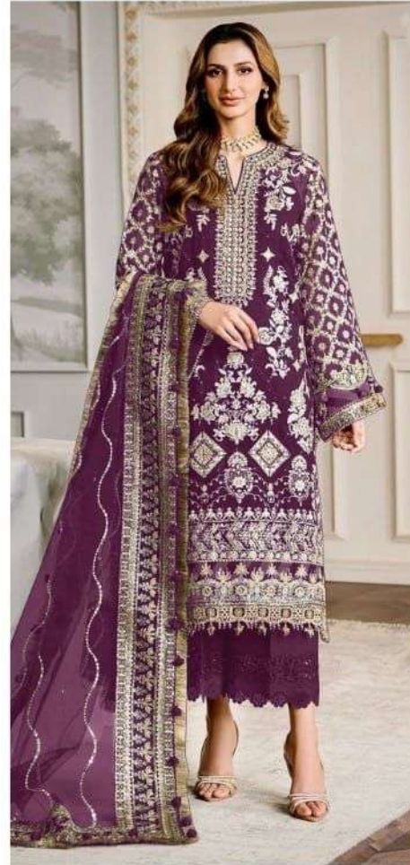
Z7773 D.No:-401 C