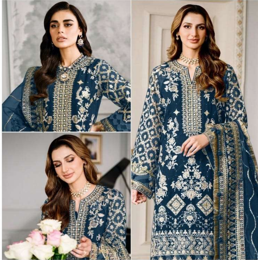
TOP- PURE FOX GEORGETTE WITH HEAVY EMBROIDERY AND SEQUENCE WORK BOTTOM/INNER- DULL SHANTOON DUPATTA- PURE ORGANZA FANCY DUPATTA AND HEAVY EMBROIDERY