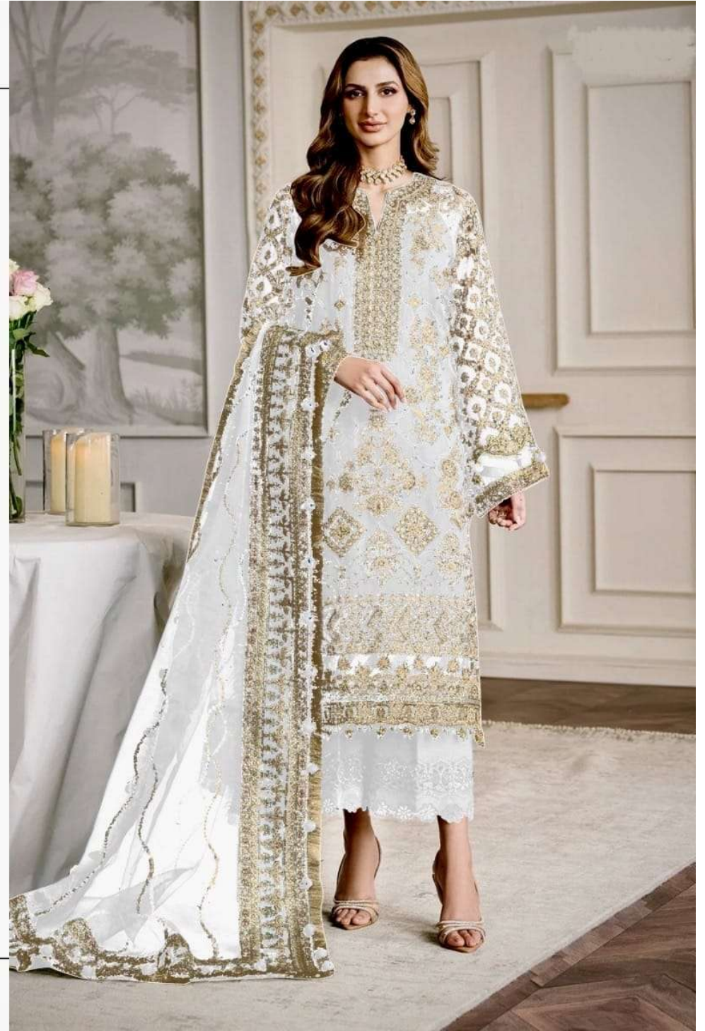
TOP- PURE FOX GEORGETTE WITH HEAVY EMBROIDERY AND SEQUENCE WORK BOTTOM/INNER- DULL SHANTOON DUPATTA- PURE ORGANZA FANCY DUPATTA AND HEAVY EMBROIDERY