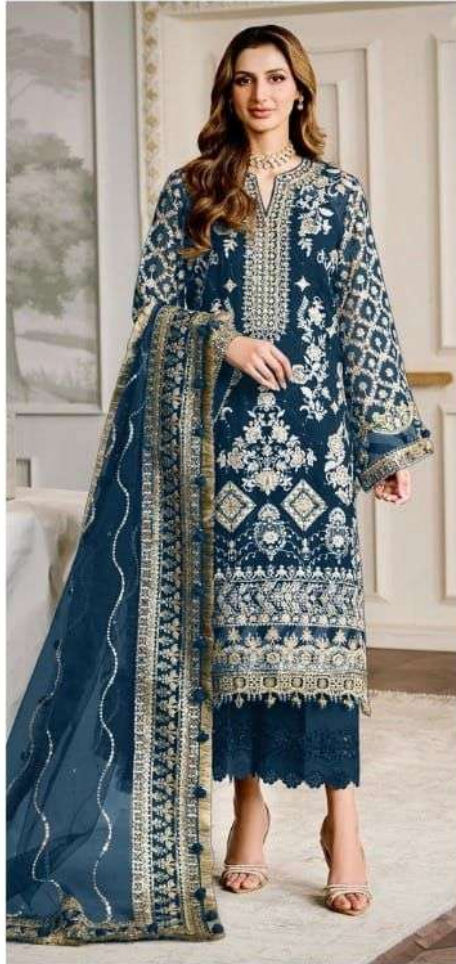
Z7773 D.No:-401 A

TOP-PURE GEORGETTE WITH HEAVY EMBROIDERY AND SEQUENCE WORK BOTTOM-INNER-DULL SHANTOON DUPATTA- PURE GEORGETTE FANCY DUPATTA AND HEAVY EMBROIDERY