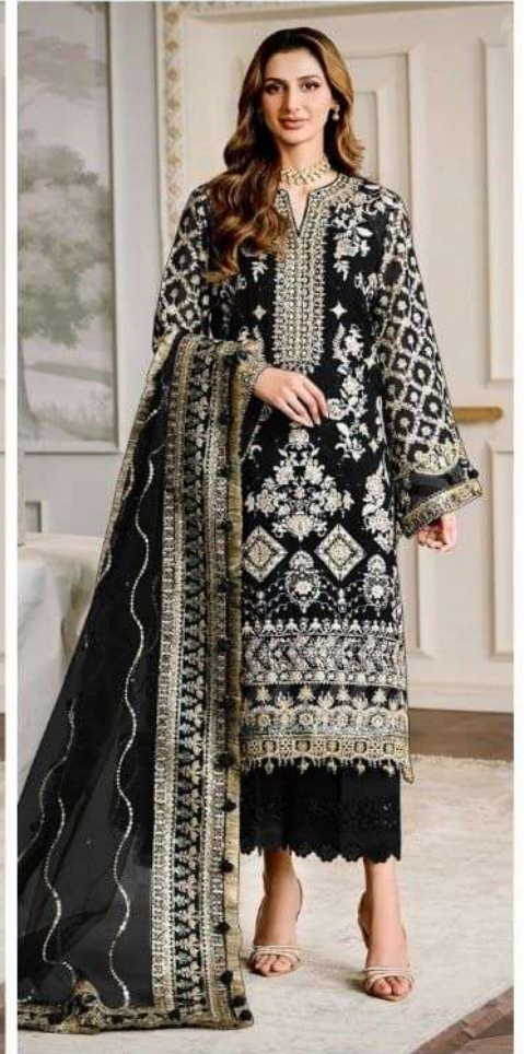
Z7773 D.No:-401 D