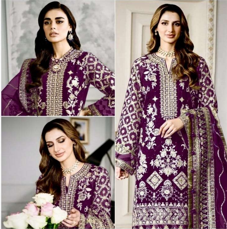
TOP- PURE FOX GEORGETTE WITH HEAVY EMBROIDERY AND SEQUENCE WORK BOTTOM/INNER- DULL SHANTOON DUPATTA- PURE ORGANZA FANCY DUPATTA AND HEAVY EMBROIDERY