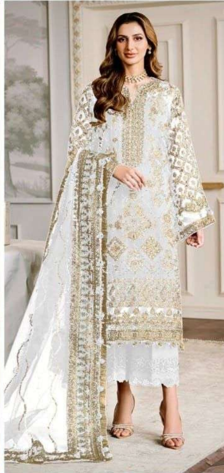
Z7773 D.No:-401 B