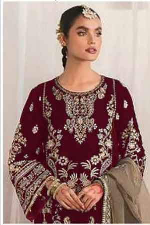
FABRIC DETAILS 1499-D TOP :: GEORGETTE DUPATTA :: GEORGETTE INNER :: SANTOON BOTTOM :: SANTOON