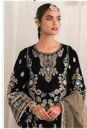
FABRIC DETAILS 1499-C TOP :: GEORGETTE DUPATTA :: GEORGETTE INNER :: SANTOON BOTTOM :: SANTOON