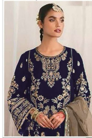
FABRIC DETAILS 1499-B TOP :: GEORGETTE DUPATTA :: GEORGETTE INNER :: SANTOON BOTTOM :: SANTOON