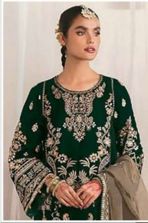
FABRIC DETAILS 1499-A TOP :: GEORGETTE DUPATTA :: GEORGETTE INNER :: SANTOON BOTTOM :: SANTOON