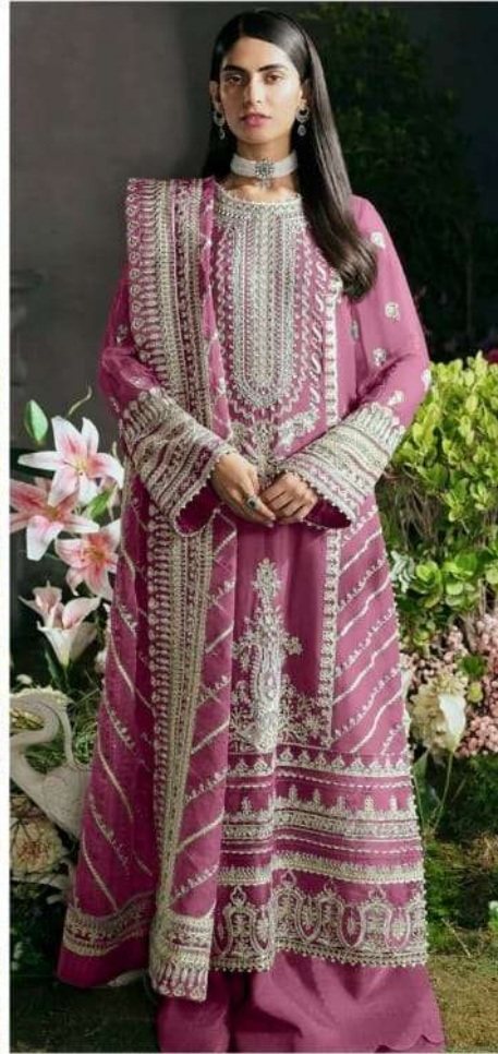
Z7773 D.No:-230 B