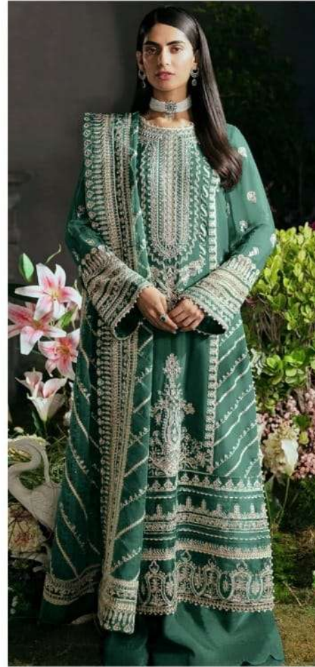
Z7773 D.No:-230 C