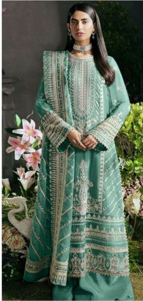
Z7773 D.No:-230 A

TOP-PURE GEORGETTE WITH HEAVY EMBROIDERY AND SEQUENCE WORK BOTTOM-INNER-DULL SHANTOON DUPATTA- PURE GEORGETTE FANCY DUPATTA AND HEAVY EMBROIDERY