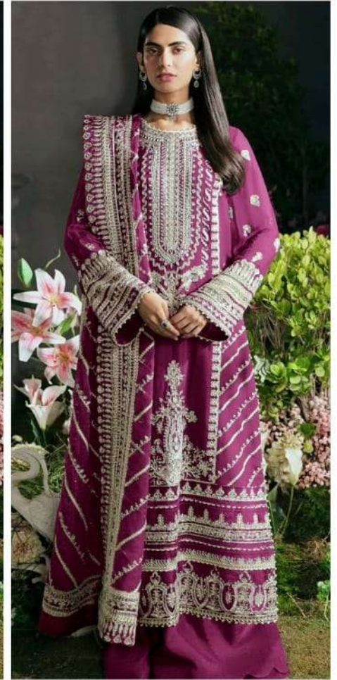
Z7773 D.No:-230 D