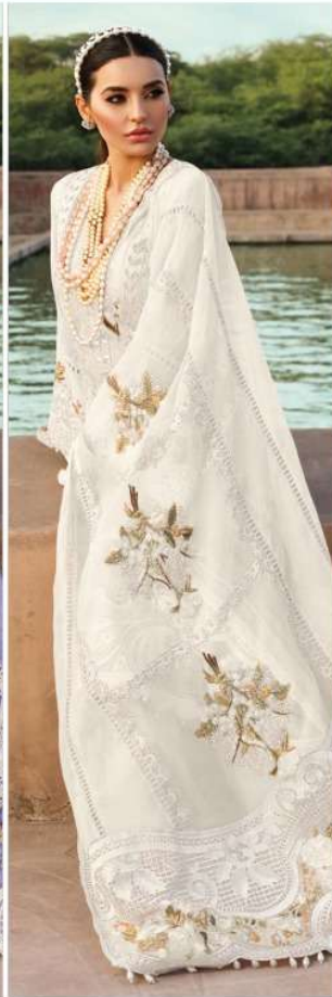
D.NO. 196 E