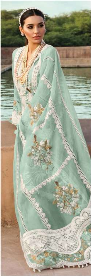
D.NO. 196 C