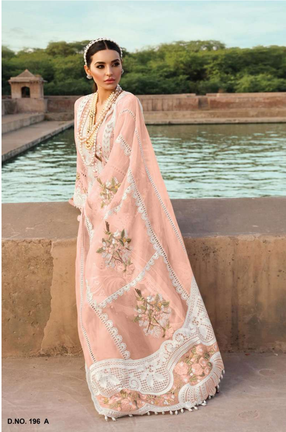
D.NO. 196 A