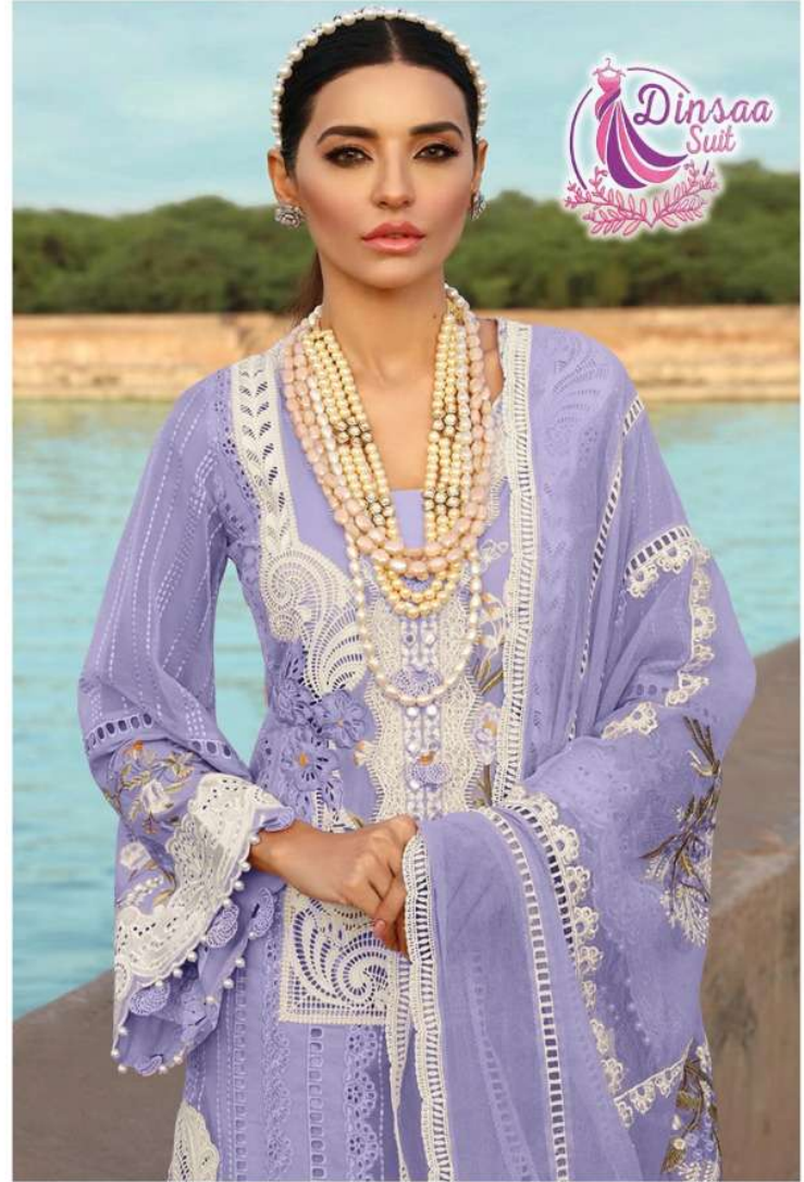
D.NO. 196 D