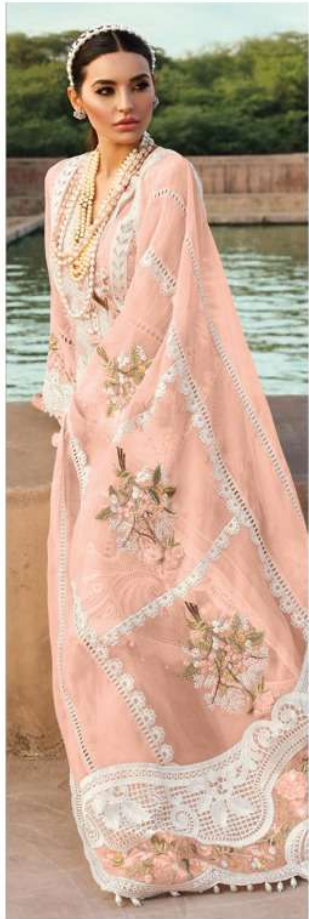
D.NO. 196 A