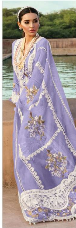
D.NO. 196 D