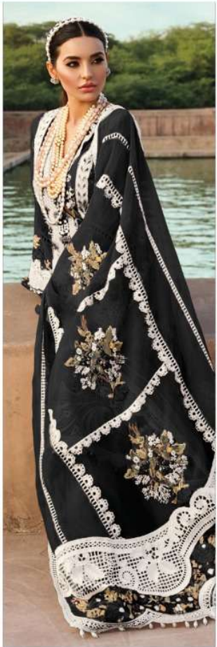
D.NO. 196 B