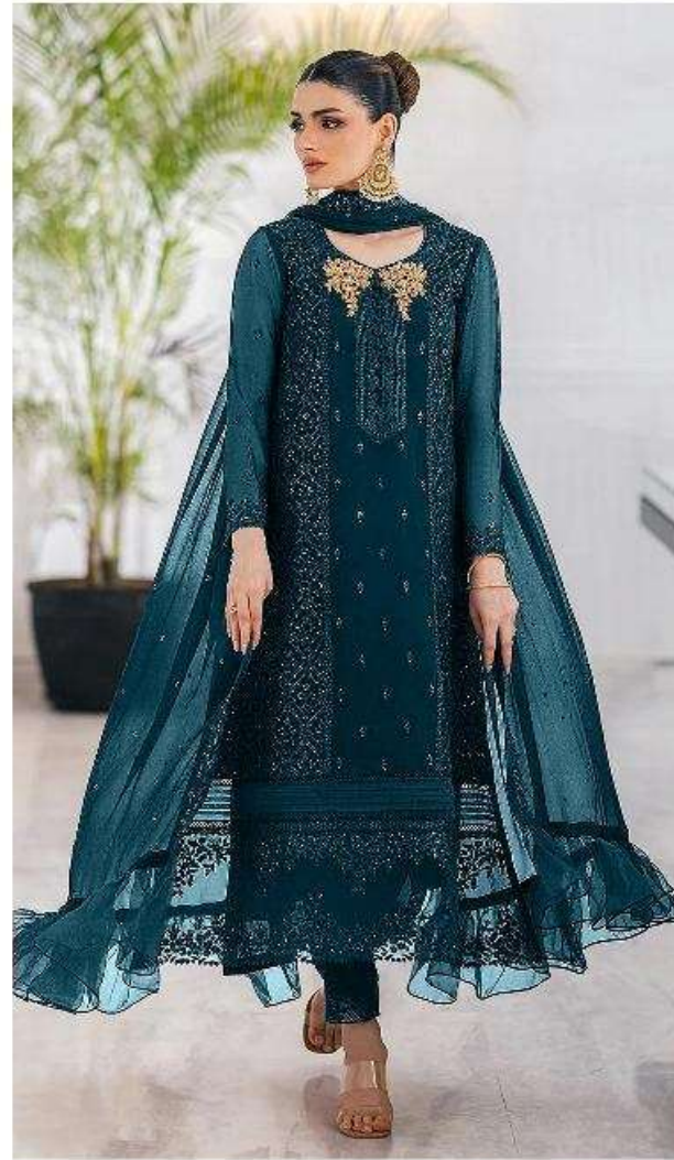
C - 1706 B