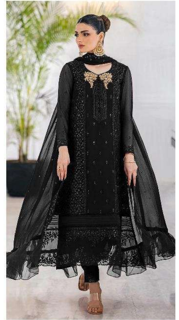
C - 1706 C