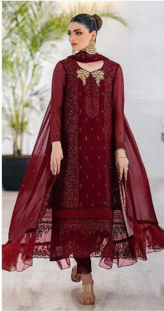
C - 1706