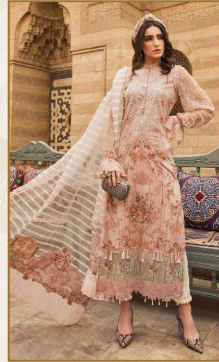
1003 HIT LIST