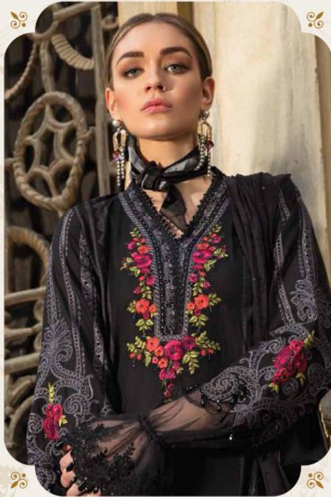
1002 HIT LIST