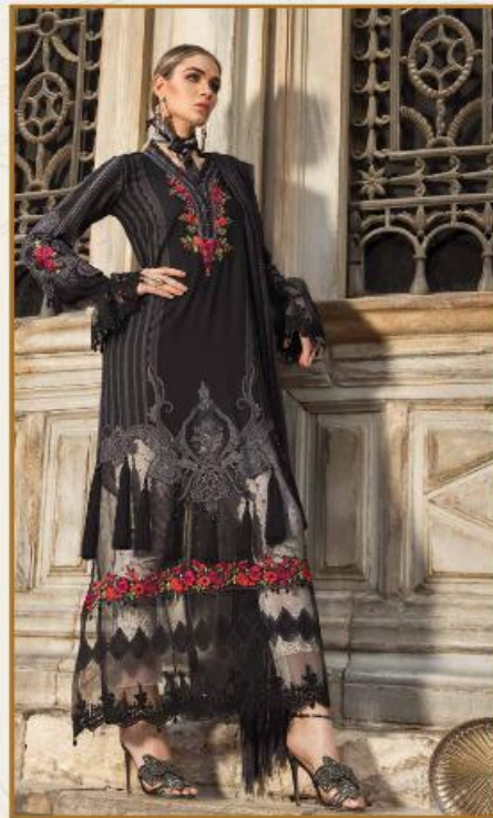
1002 HIT LIST