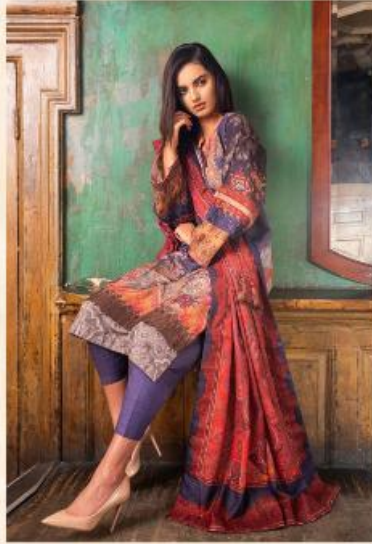
Design * 402