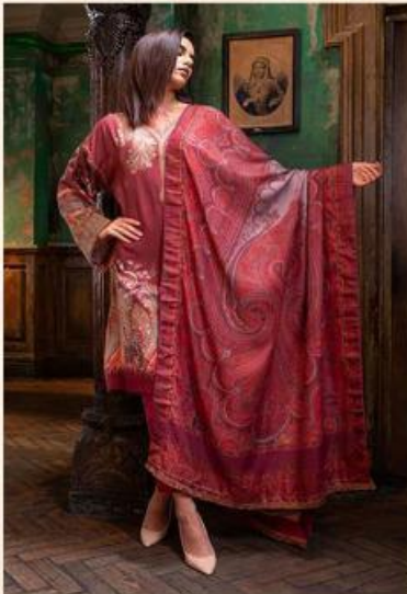
Design * 403