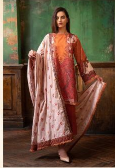
Design * 405