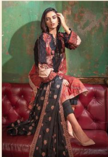
Design * 404