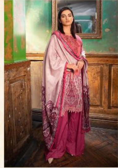
Design * 406