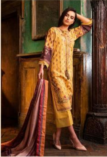
Design * 401