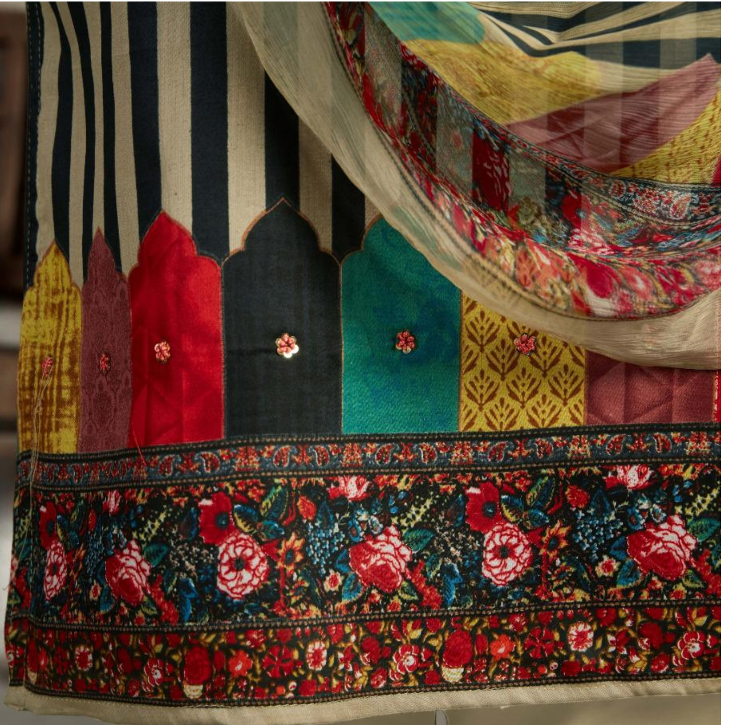
BEAUTIFUL COLOUR PRINTED DRESS DUPATA INSPIRED BY THE BEAUTY OF NATURE