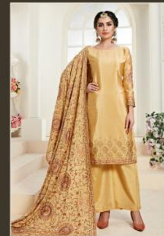
2003 - D