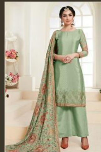
2003 - C