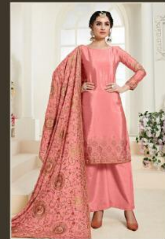
2003 - B