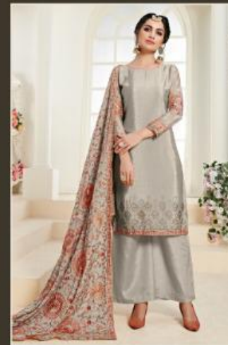
2003 - A