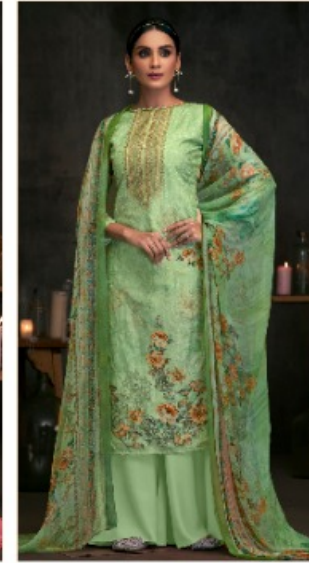
d.no : 8802