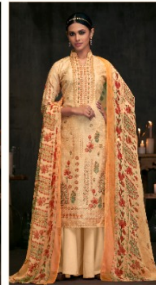
d.no : 8805