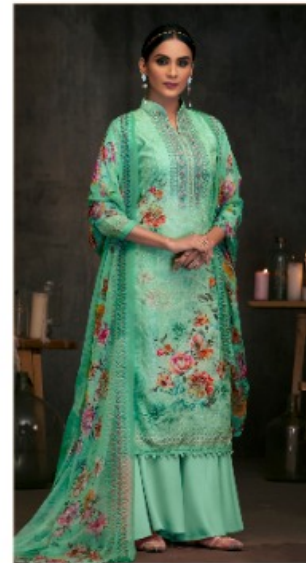
d.no : 8804