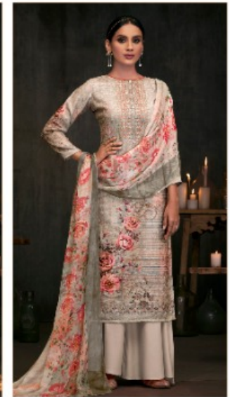
d.no : 8806