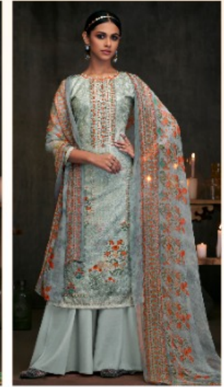
d.no : 8803