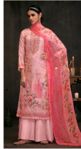
d.no : 8801