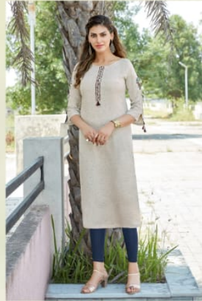
d.no : 235