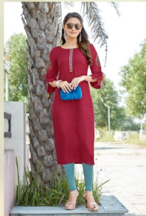
d.no : 237