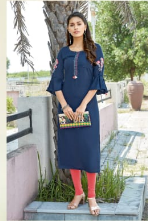
d.no : 236