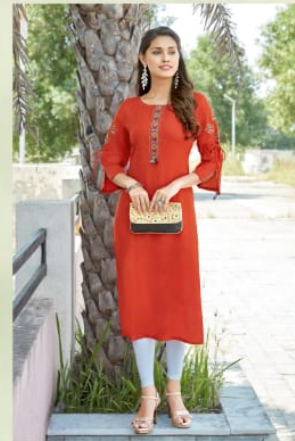
d.no : 239