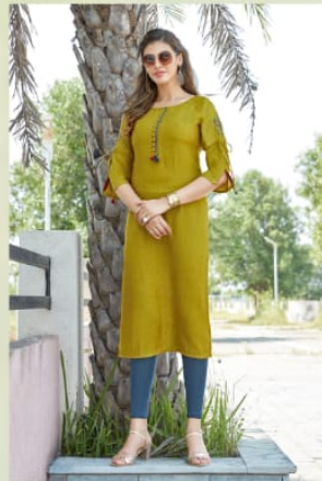
d.no : 238