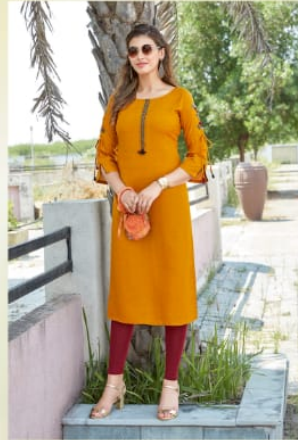
d.no : 234