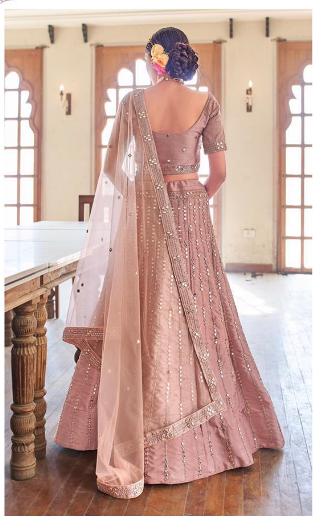
Flaunt the pretty colors and exquisite designs coupled with quality and freshness.