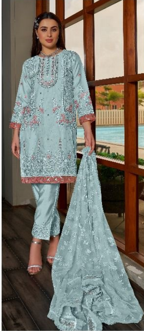
C - 1669