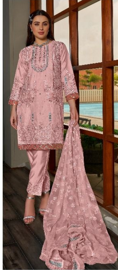
C - 1669 B