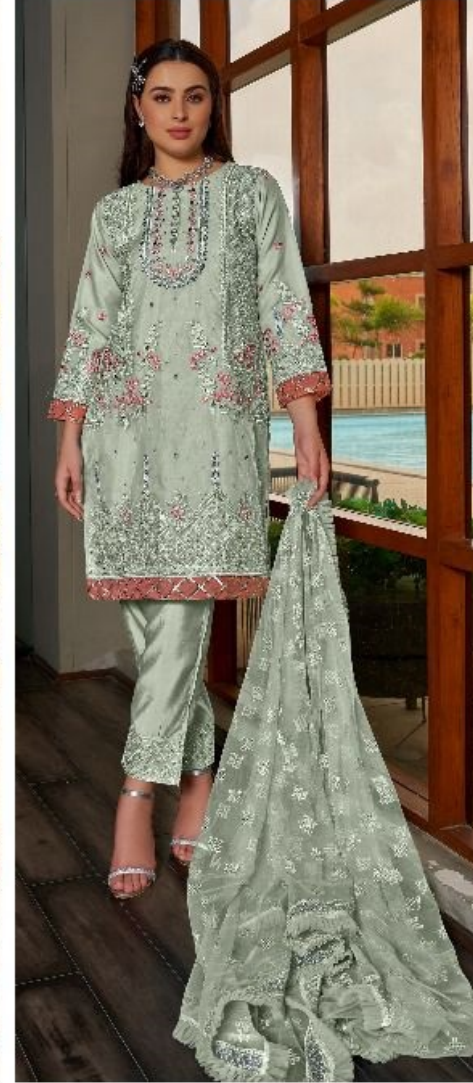
C - 1669 C