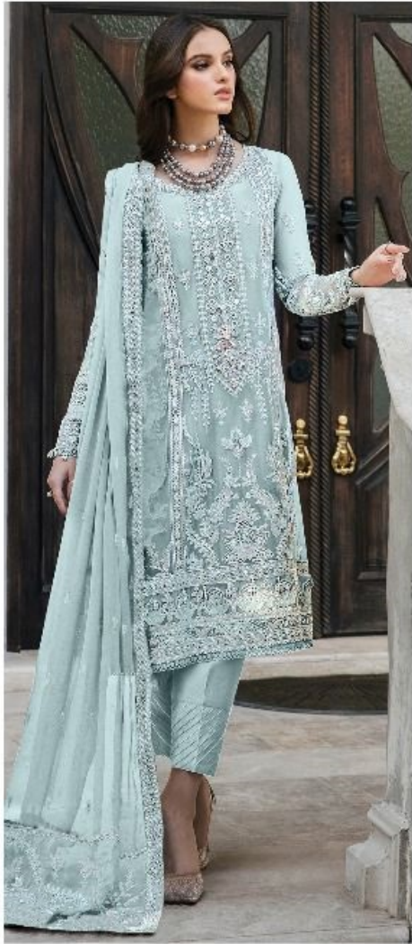
D - 5424 A