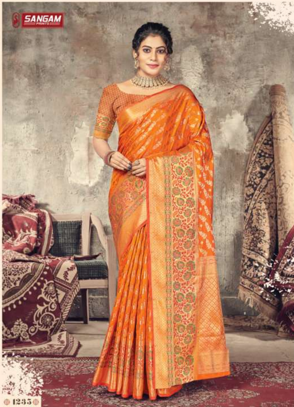
Be style icon in any occasion by wearing this beautifully crafted designer saree and will surely get you great compliment.